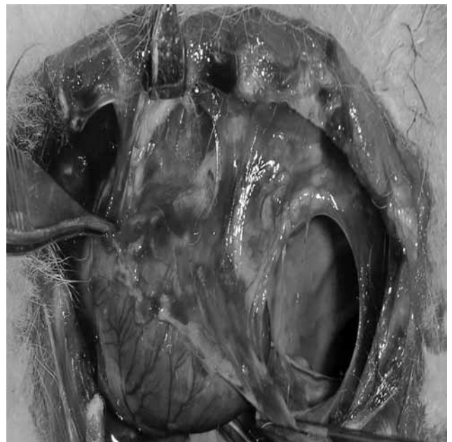
Figure 1. Three weeks after the initial operation, severe pericardial adhesions (grade 3), which necessitated a sharp dissection, were observed between the epicardium and mediastinal tissues in group 1.

The scoring schemes of Lu et al. [17] were used to grade the inflammation (0= no cell infiltration, 1= sparse infiltration of the neutrophils, lymphocytes, and plasma cells, 2= focal infiltration of the neutrophils, plasma cells, and lymphocytes, 3= diffuse infiltration of the neutrophils, plasma cells, and lymphocytes) and the fibrosis (0= no fibrous reaction, 1= sparse, focal fibrous connective tissue, hyalinization, and fibrin deposition, 2= a thin layer of fibrous connective tissue, hyalinization, and fibrin deposition, 3= a thick layer of fibrous connective tissue, hyalinization, and fibrin deposition). The mesothelial cell layer thickness was graded from 1 to 5 as described by Tsukihara et al. [18] in which 1 represented a very thin mesothelial cell layer and 5 signified a mesothelial cell layer with the same thickness as the native pericardium (Figures 2a, b, c, and d).