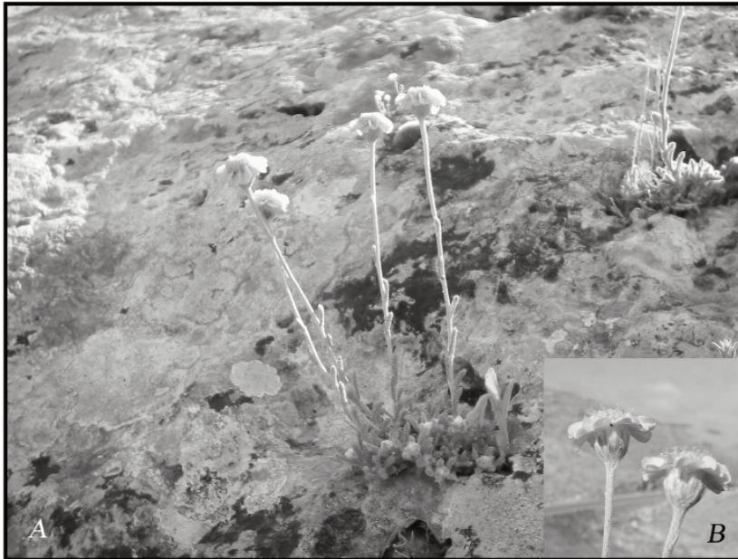
Figure 3. Achillea brachyphylla . a) Habit and habitat; b) Capitulae.

Distribution: Turkey: C7 Şanlıurfa: Nimrud Dag (Nemrut Da. nr Kahta), Sintenis 1888:815. Tektek Mountains Rüstem Stream, 600 m, 29.iv.2001, Ö.F.Kaya sn! 44 km from Şanlıurfa to Viranşehir, Tektek Mountains, Çoban Boğazı Pass, calcareous slopes, 07.vi.2002, B. Yıldız 15136! & T. Arabacı ; Op. cit., 24.v.2003, T. Arabacı 1512! Op. cit., 23.iv.2004, T. Arabacı 1633! 12 km from Şanlıurfa to Birecik, Pinus L. forested area, 550 m, 22.iv.2004, T. Arabacı 1630!