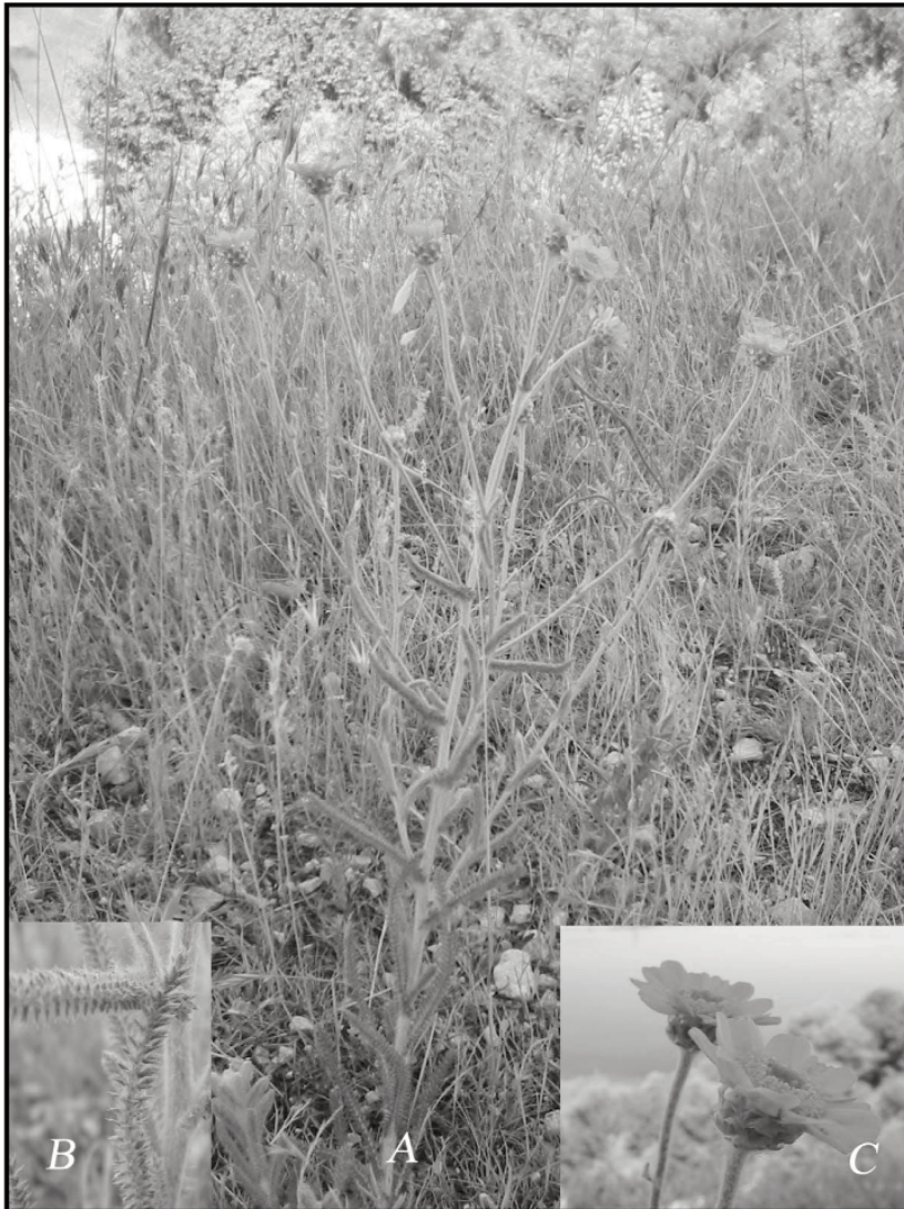
Figure 1. Achillea membranacea . a) Habit and habitat; b) Leaves; c) Capitulae.

8 × 3.5 mm, obtuse, with 1-2 mm pellucid margins; receptacle paleaceous; palea lanceolate, 6-7 × 2-2.5 mm, acute, scarious, glabrous. Ray florets 10-15(-16), yellow, 9-15 × 3-12 mm, limb semi-elliptic and 3-lobate, 6-12 × 3-4 mm, female, fertile; style 3.5 × 0.1-0.2 mm, style arms brownish, 0.5 mm; disc florets c. 50-70, yellow, 4.5-5 × 1 mm; style 4 × 0.2 mm, style arms brownish, 1 mm; stamens 5, anthers 2 × 0.3 mm, pale yellow, obtuse at the apex and base, filament 2.5 × 0.2 mm; ovary 2 × 0.7-0.9 mm long; achenes obovate, 2.5-3 × 1.5-1.75 mm, brownish, compressed dorsally, lineate, ribbed; pappus absent.