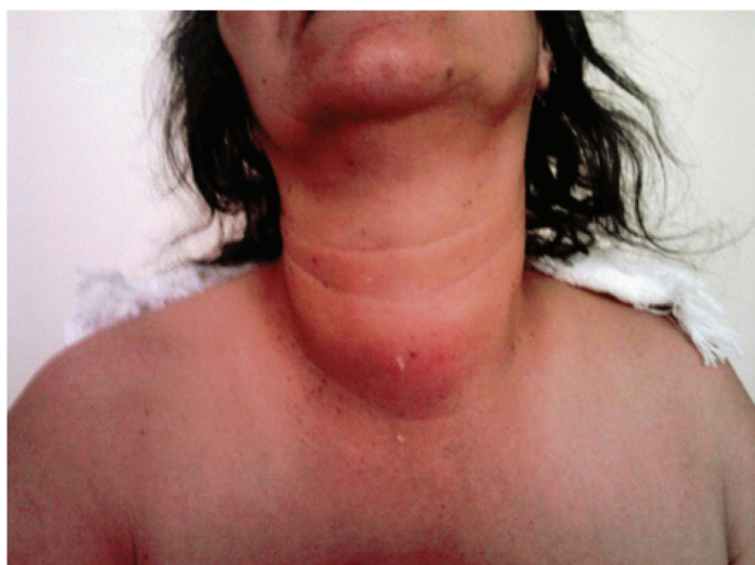
[Table/Fig-1]: Pre-operative image

At check-up on the 12 th day after treatment, ultrasound examination revealed a hypo-anechogenic internal structure containing fine linear echogenic striations approximately 52x25 mm in size and heterogeneous echogenicity surrounding both lobes around the nodule on which FNA biopsy had been performed inside the thyroid gland [Table/Fig-2c]. Drainage was performed with a 6F percutaneous pigtail abscess drainage catheter [Table/Fig-2d]. The material removed was yellow, thick and non-odorous. Temperature, leukocytosis and CRP were normal. The patient's laboratory findings are shown in [Table/Fig-3]. No bacteria were observed at Gram-staining of the abscess material. There was no growth in aerobic and anaerobic