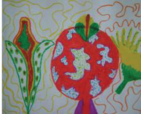
Fig.1. (a) painting no 18; (b) painting no 5