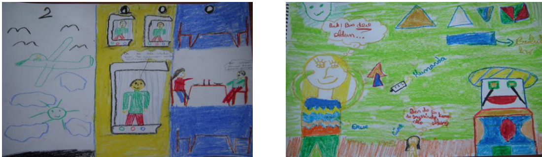
Fig. 4. (a) painting no 2; (b) painting no 4