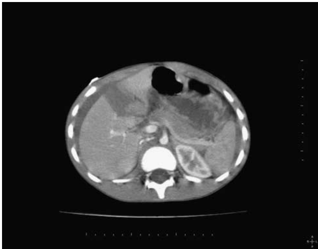
Figure 2. Common free fluid.

hypotension and tachycardia ensued. One unit of O Rh (-) erythrocyte suspension was administered. He became confused and vital signs were as follows: Blood Pressure 60/40 mm/Hg and pulse rate was 136/minute. Perioperative haemoglobin was Hb: 2.75 g/dl and Hct was 13%. On laparotomy one liter of free blood was suctioned by surgeon. Examination revealed total laceration of extrahepatic bile ducts and right lobe, as well as 60% laceration of left lobe. Portal vein sustained a 70% laceration. The portal vein was clamped first, and then repaired by cardiovascular surgeon. Then lacerated liver segments and extrahepatic bile ducts were repaired. Abdomen was closed following placement