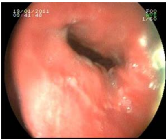
FIGURE 2. Endoscopic findings of oesophagitis (Patient No: 35)

Erosions involving the region from the distal oesophagus to the z-line with a streaky pattern.