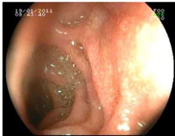
FIGURE 3. Macroscopic alterations ranging from erythema to mucosal erosions in duodenum

Erosions involving the region from the distal oesophagus to the z-line with a streaky pattern.