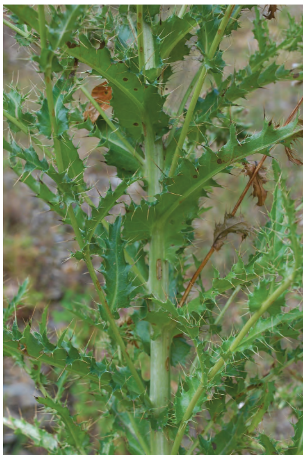
Figure 2. Cirsium candelabrum Griseb. A: Synflorescence; B: Stem and leaves.

Ustipraca ad fluvium Drina, 340-400 m, 08.1911, Maly s.n. (BM!).