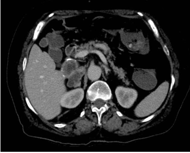
Figure 3— Axial contrast enhanced MDCT image showing partially calcified exophytic liver hydatid cyst protruding and invading the IVC (arrow).

branches, are seen. Intra-arterial lesions may cause enlargement of the vessel and an enhancement of the cyst wall may be detected (1, 6).