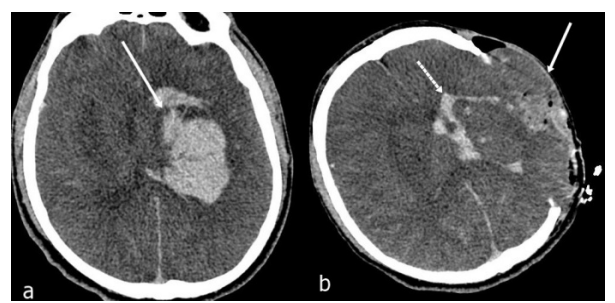
Figure 3: The preoperative CT shows the paranchymal hemorrage (arrow) the level of left basal ganglia (a). External brain herniation (dashed arrow) is seen after craniectomi in postoperative CT image (b).

Cardiac arrest became during follow-up in the emergency department cardiopulmonary resuscitation was performed. Ventricular fibrilation current was observed on the monitor. He was defibrillated with 200 joules. The patient returned to sinus rhythm after 15 minutes. He was intubated and taken to intensive care unit (ICU). During the followup GCS reduced to 3 on the 4th day in the ICU. Parenchymal hemorrhage was observed in the brain CT at the 4 level of left basal ganglia (Figure 3). The patient was operated due to intracranial high pressure. After operation, the patient remained comatose and died 8th day of admission.