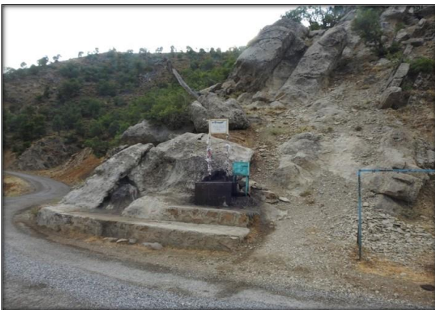
Photograph 4: Hızır Taşı Visiting Area