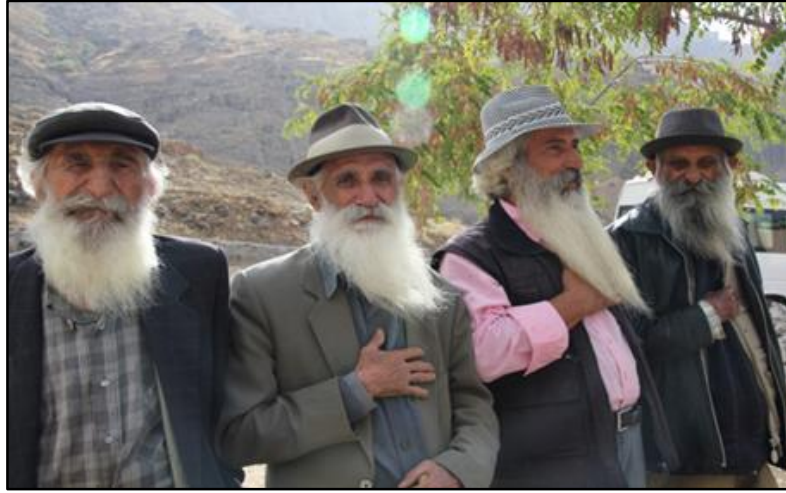
Photograph 1: Alevi Dedes in the Nazimiye Region

been a factor that has made the fieldwork difficult. Therefore, access to all the places is provided by private vehicle or with the help of people living in the surrounding villages. The fact that it is a region where terrorist incidents are seen also limited the fieldwork. Due to terrorist incidents during the fieldwork, security forces blocked the entrance and exit to the sacred places for 2 weeks.