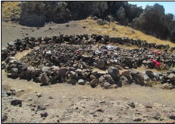
Photograph 2: Düzgün Baba Visiting Area

The factors that attract visitors to the holy places in this region are not merely healing and intercession. The sacred places in the region are representative of their faith and are also places that feed individuals in the sense of faith. With the reflections of the traditions that have been going on since the past, these sacred places emerge as the fields that give people a sense of belonging.