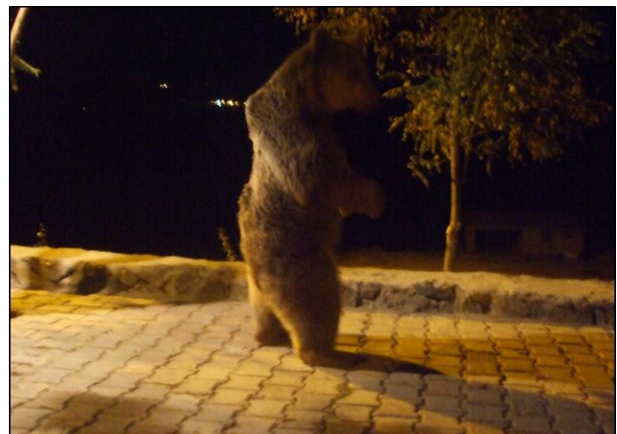
Photograph 9: Deers and Bear in Düzgün Baba Visiting Area