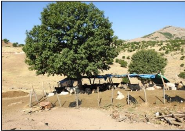
Photograph 6: An image from sacrifice animals

When the order in the sacred places is kept alive according to the traditions and customs learned from the ancestors and people living in the region, this idea is dominant: "The sacred souls will always exist with them". According to this conception, the place is totally shaped according to the blessed. For example, visitors who come to the Düzgün Baba for the purpose of sacrificing choose their sacrifice animals and the chosen ones go to the slaughterhouse. Pir makes the sacrifice prayer, and after that prayer, their sacrifice animals are cut off (Photograph 6 and 7).