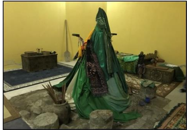
Photograph 3: Kureyş Baba Visiting Area