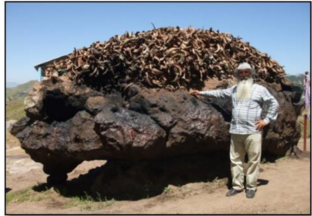
Photograph 7: An image from horns of sacrificed animals

When they decided to build Düzgün Baba Djemevi, they started working to build it on the top of a mountain. For this, the road to the mountain began to be carved first. The road was started to be carved, but the digger machines were broken down, and they didn't work. Workers dreamed Düzgün Baba in their dreams and they were warned not to build djemevi at the top of the mountain but at the skirts of the mountain. That is why the road was left halfway. Djemevi was built in the place which was asked by Düzgün Baba. This is his place. Things should be as he wants (R. P. 1).