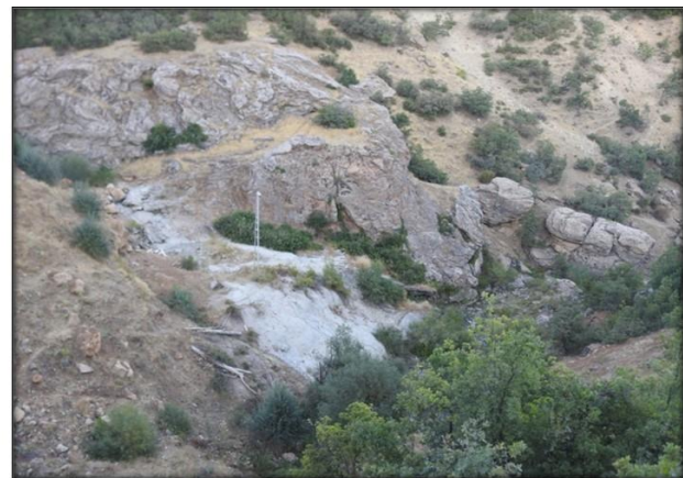
Photograph 5: Moro Sur Visiting Area

In the areas of visit, there is a practice called "Çıralık"; people donate according to their wishes. This money, which is given by consent, is provided for service or for people who need help. However, some of the local people have recently