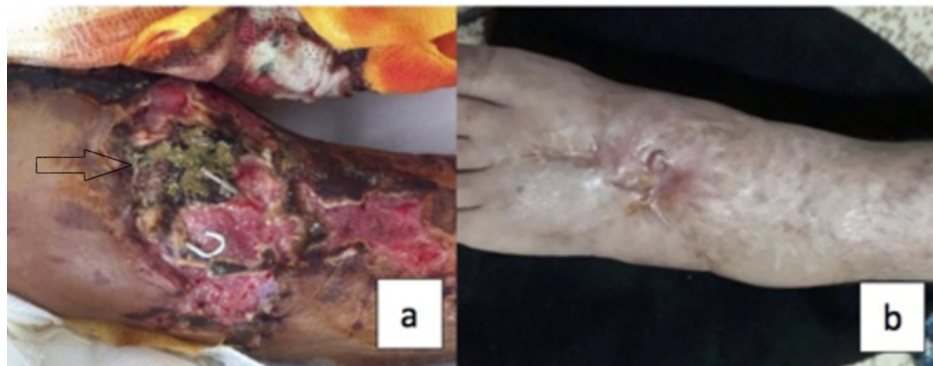
FIGURE 3: (a) Dorsum of the patient's foot before treatment when the patient was diagnosed with aspergillosis. (b) Dorsum of the patient's foot about one year after treatment, the patient has mild weakness of dorsiflexion of his ankle due to his extensor tendon repair.