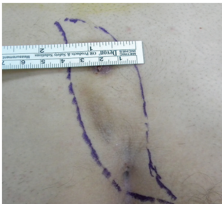
FIGURE 1: Margins for S-shaped oblique excision including the pilonidal sinus.

(diseased area more than 5 cm from the intergluteal sulcus), and acute infection were excluded. Each patient was informed about the operation to be performed and gave their written consent. The operations were performed by the first (MY) and second (FC) authors. Age, gender, body mass index (BMI), primary and recurrent disease, duration of the symptoms (pain, abscess history, and chronic purulent discharge), and length of hospitalization were recorded. The patient characteristics are summarized in Table 1. Patients were evaluated in terms of operation time, postoperative complications (including infection, flap edema, wound dehiscence, seroma formation, flap necrosis, and maceration), recurrence rate, return-to-work time, and cosmetic satisfaction.