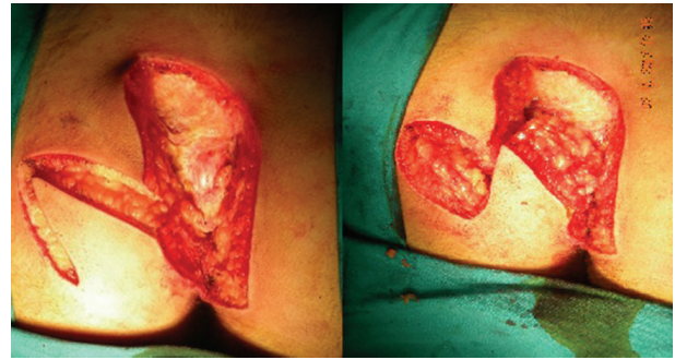
FIGURE 2: Flap preparation after excision of pilonidal sinus.

2.1. Surgical Technique and Postoperative Care. In this surgical procedure, the sinus tract was first excised in the prone position, descending as far as the postsacral fascia with an S-shaped oblique incision facing either right or left (Figure 1). A broad-pediced full-thickness flap resembling a Dufourmentel flap was prepared to include the fascia over the gluteus maximus from the inferior half of the incision (Figure 2). Following careful hemostasis, the flap was transposed onto the defect in the postsacral fascia (Figure 2).