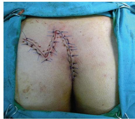
FIGURE 3: Appearance after flap reconstruction.

The subcutaneous tissue of the flap was sutured to the fascia of the gluteus maximus with polyglactin 0 sutures, and the skin was closed with 2-0 polypropylene sutures (Figure 3). The tissue edges in the area from which the flap was taken were similarly sutured. No drain was used in any patient.