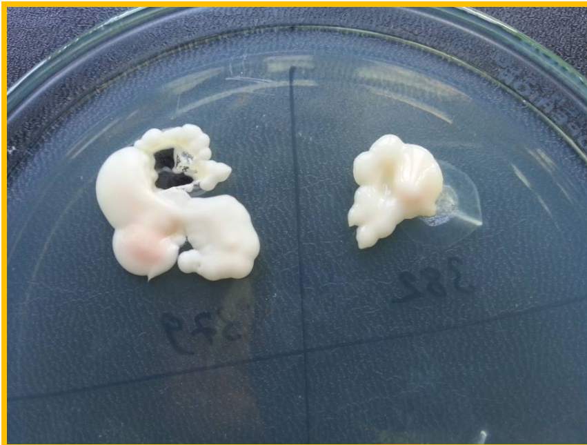
Figure 2: Cryptococcus neoformans . Sabouraud dextrose agar, 25°C, 5 days, surface of colony