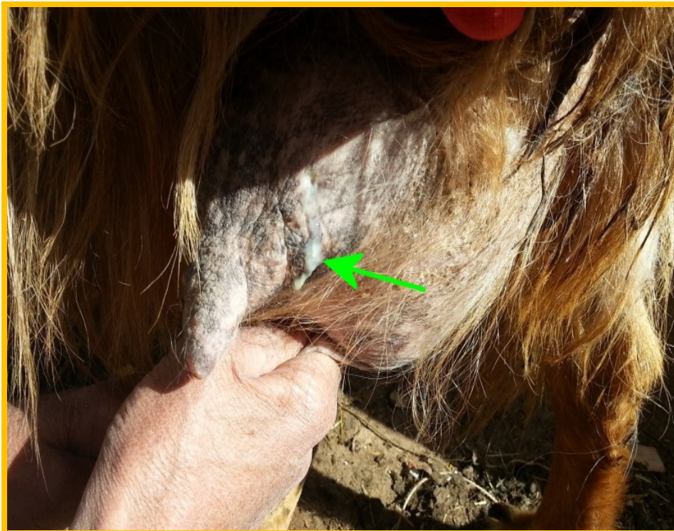
Figure 1: A hair goat with clinical mastitis