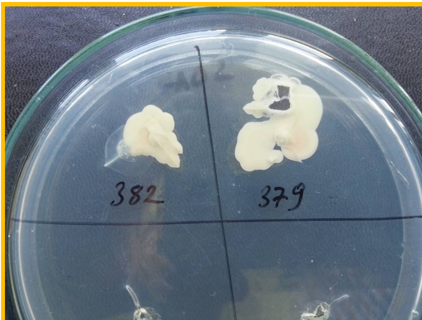
Figure 3: Cryptococcus neoformans . Sabouraud dextrose agar, 25°C, 5 days, reverse of colony