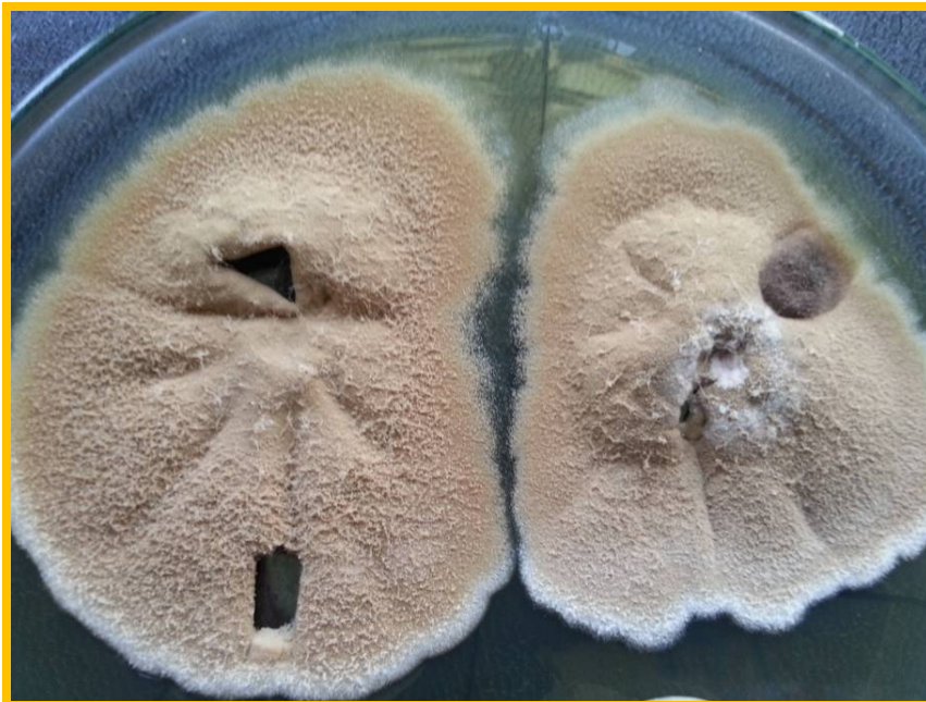
Figure 4: Scopulariopsis brevicaulis . Sabouraud dextrose agar, 25°C, 7 days, surface of colony