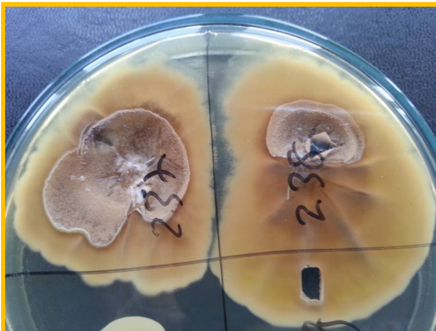
Figure 5: Scopulariopsis brevicaulis . Sabouraud dextrose agar, 25°C, 7 days, reverse of colony