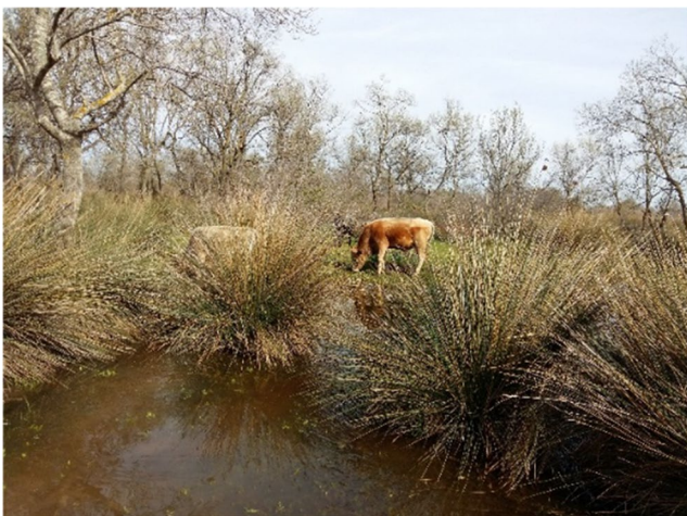
Fig. 8 Rich biological diversity observed in the floodplain area