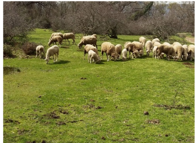
Fig. 9 Animal husbandry is widely practiced in the floodplain area, with small ruminants visible in the photograph