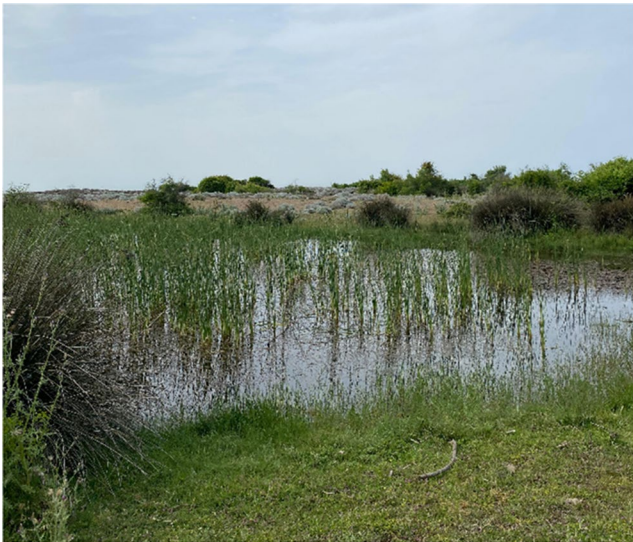
Fig. 6 Wetlands of various sizes can be seen in the Karacabey longoz forest area