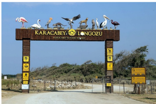
Fig. 3 Entrance of the Karacabey Floodplain Forest

Geochemical and Risk Data (Sediment Analyses and Heavy Metals) To understand the current environmental status of the floodplain and the anthropogenic pressures to which it is exposed, sediment pollution data obtained from the Dalyan and Poyraz lagoons were examined (Aykır et al. 2023). Eighteen surface sediment samples (0–5 cm) were collected from the Dalyan Lagoon, and a short sediment core extending to a depth of 40 cm was extracted from the Poyraz Lagoon. Concentrations of potentially toxic elements (As, Cd, Cr, Cu, Hg, Ni, Pb, Zn, etc.) were analyzed in the collected samples using inductively coupled plasma mass spectrometry (ICP-MS). In order to obtain clues about