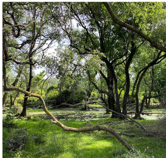
Fig. 5 Karacabey Longoz Forest contains every shade of green

the transport and accumulation processes in sediments, total organic carbon (TOC), carbonate percentage, and chlorophyll degradation products (pigments) were also measured. The heavy metal concentrations obtained were interpreted using various environmental risk indices to assess sediment quality and pollution levels. For example, the Modified Ecological Risk Index (mPER) and the Ecological Contamination Index (ECI), which consider the enrichment and toxicity potential of each element relative to its background value, were calculated. Similarly, the Hazard Quotient (HQ) and Lifetime Cancer Risk (LCR) values were calculated to evaluate the possible impacts of accumulated pollutants in sediments on human health. The scales used in the evaluation of the data are provided in Supplementary Data 1. These geochemical analysis results were recently published by Aykır et al. (2023), showing that the Dalyan and Poyraz