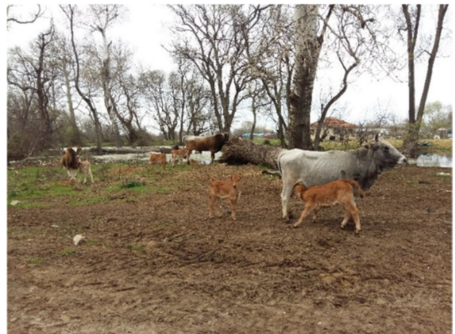
Fig. 10 Cattle breeding activities continuing in the floodplain forest

lagoons carry a medium level of ecological risk particularly due to Cd and Hg accumulation, and that carcinogenic risks associated with some metals, especially Ni, exceeded acceptable thresholds. Consequently, critical information was obtained regarding the level of pollution in the floodplain and its implications for both the ecosystem and public health. These data directly contributed to the “conservation priority” criterion in our evaluation, quantitatively revealing the extent of threats and risks in the region.