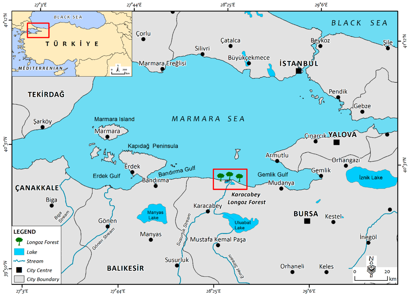
Fig. 1 Location map of study area