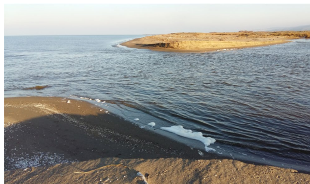
Fig. 4 View of the section where the Susurluk River, the freshwater source of the Karacabey Floodplain Forest, flows into the Sea of Marmara

Geochemical and Risk Data (Sediment Analyses and Heavy Metals) To understand the current environmental status of the floodplain and the anthropogenic pressures to which it is exposed, sediment pollution data obtained from the Dalyan and Poyraz lagoons were examined (Aykır et al. 2023). Eighteen surface sediment samples (0–5 cm) were collected from the Dalyan Lagoon, and a short sediment core extending to a depth of 40 cm was extracted from the Poyraz Lagoon. Concentrations of potentially toxic elements (As, Cd, Cr, Cu, Hg, Ni, Pb, Zn, etc.) were analyzed in the collected samples using inductively coupled plasma mass spectrometry (ICP-MS). In order to obtain clues about