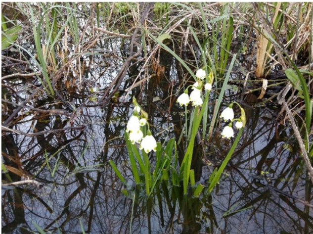
Fig. 7 Rich biological diversity observed in the floodplain area