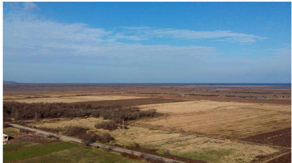
Fig. 2 East to west view of the Karacabey Floodplain Forest, with the lagoons clearly visible in the upper right corner

Swan Coastal Plain. In the Karacabey Floodplain Forest, morphology–hydrology–stratigraphy–palynology components were considered together, and selected biosites (Poyraz, Dalyan) were evaluated as representative units.