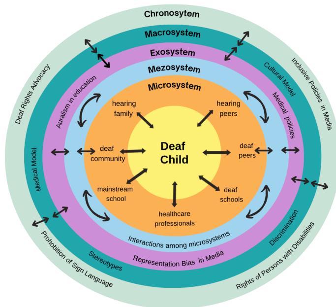
Figure 2. Adaptation of Bronfenbrenner's Bioecological Model to Deaf Identity Development (adapted from Bronfenbrenner, 1979)