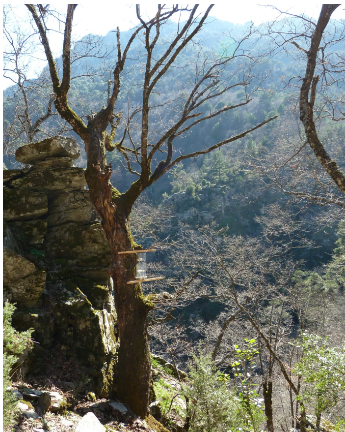
Fig 1: Old hollow oak with window trap – Ida mountain 2011.

One oak stand with old hollow individuals was examined in Kazdağı National Park (Edremit, Balıkesir, Fig. 1). In total 11 hollow oaks were surveyed. All the oaks surveyed belong to the species Quercus frainetto (Tenore 1813). The trees were studied by using two different trap types for sampling saproxylic beetles: window traps and pit fall traps. The window traps (W-trap) consisted of a 30 x 60 cm wide transparent plastic plate with a tray underneath (Jansson & Lundberg 2000). They were placed near the trunk (<1 m), beside or in front of the cavity entrance.