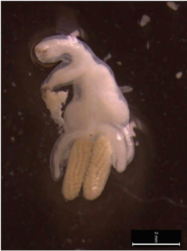
Fig. 3: Parabrachiella merluccii ♀ (scale bar 2 mm). Sl. 3: Parabrachiella merluccii ♀ (merilo 2 mm).

6.6% and 1, respectively. The total number of parasites was 10.