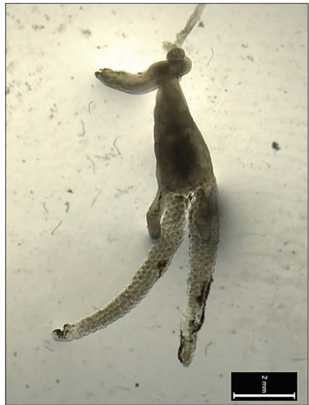
Fig. 1: Parabrachiella insidiosa , ♀ (scale bar 2 mm). Sl. 1: Parabrachiella insidiosa , ♀ (merilo 2 mm).

All parasites were firmly attached to the gill rakers. The prevalence and mean intensity of parasite were 9.33% and 1.35, respectively. The total number of parasites was 19. The body length of P. insidiosa varies from 8 to 12 mm (Fig.1). Trunk longer than broader, with 2 pairs of posterior processes. Cephalothorax and second