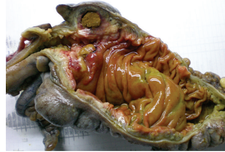
FIGURE 2: Macroscopic image of resection piece with diverticulum in caecum, thickening in diverticulum wall, and fecaloma within.

In the radiological examination of the patient, the erect abdominal radiography revealed no specialty. In the USG performed, free fluid between intestinal loops in the right lower quadrant was determined. The patient was taken into operation with prediagnosis of acute appendicitis and abdomen was entered with Mc Burney incision. Retrocecal localized appendix was monitored normal and pericecal minimal free fluid in serous quality was seen in exploration. Inflame caecum diverticulitis with a root of 1 cm diameter, 1.5 cm long and 1 cm diameter was determined in the continuation of exploration, on the front wall of caecum, 1 cm proximal