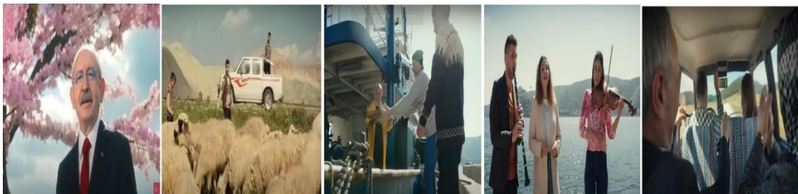
Figure 4. Scenes Between the Beginning and the 34th Second of the Advertisement

Denotation 2: In this segment of the commercial, a young man and a middle-aged man engage