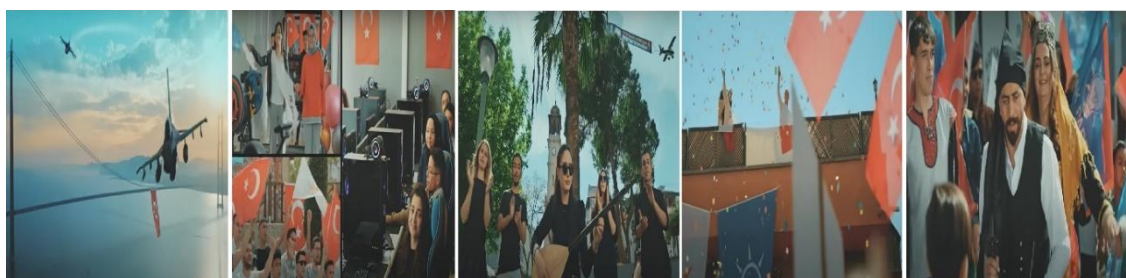
Figure 2. Scenes Between the 26th second and the 1st minute 28th second of the Advertisement

Denotation 3: In this section, a bride and groom holding a Turkish flag and an AK Party flag are first