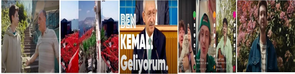
Figure 5. The scenes between the 34th second and the 1st minute 18th second of the Advertisement

Denotation 6: In this segment of the advertisement, Kemal Kılıçdaroğlu and young individuals appear on the TikTok screen. Middle-aged individuals are shown casting their votes at a ballot box set up in a school. A business owner hangs a sign on his shop door stating, "I went to vote, I will be back." Young individuals are depicted standing under a blossoming tree with expressions of disappointment and melancholy. Subsequently, the leaders of the Table of Six appear under the same tree.