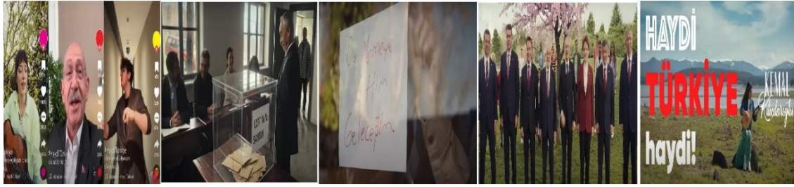
Figure 6. Scenes Between the 1st minute 19th second and the End of the Advertisement