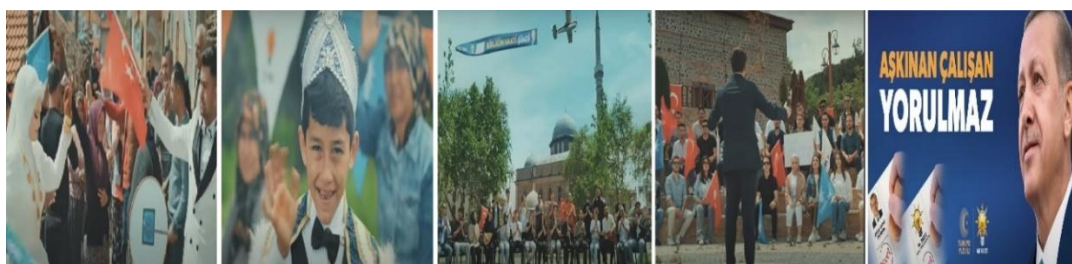
Figure 3. Scenes Between the 1st minute 28th second and the End of the Advertisement