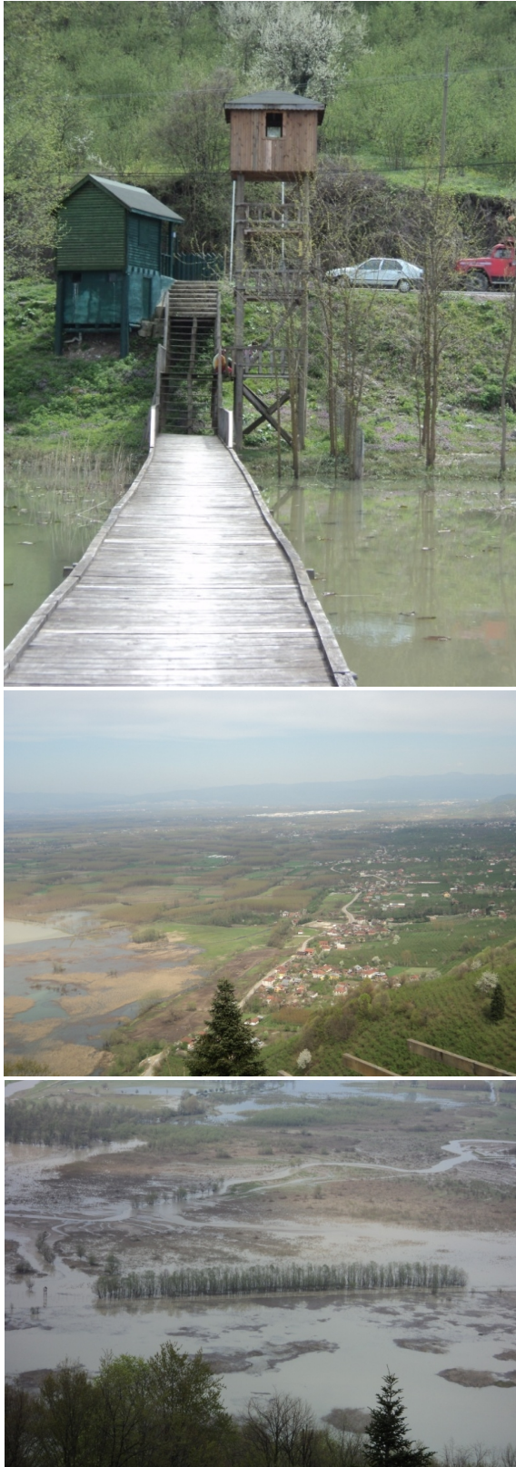
Photo 4. Scenes from Efteni Lake Wetland Area