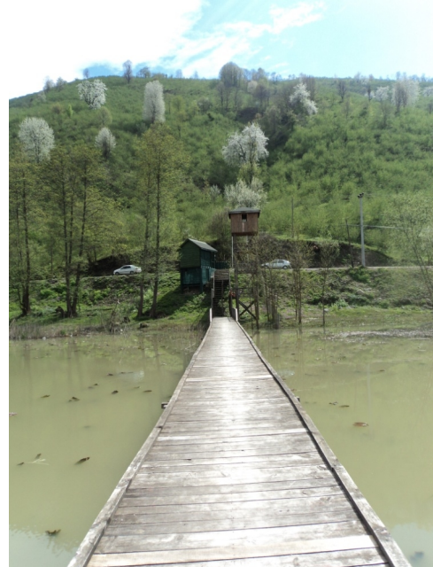
Photo 2. View of Efteni Lake Observation Tower and Jetty