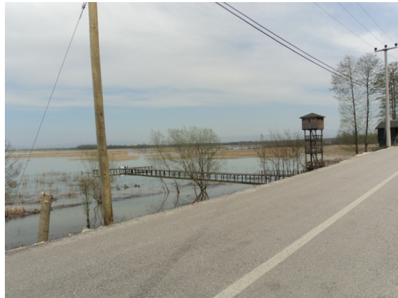
Photo 3. Scenes from Efteni Lake Wetland Area

✓ Projects and actions plans developed for the restoration and rehabilitation of Efteni Lake Wetland Area whose ecological character has been destroyed need to be out into effect immediately.