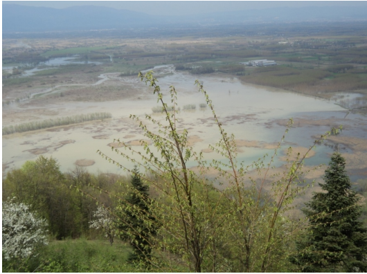
Photo 1. View of Efteni Lake Wetland Area from Elmacık Mountain in the South